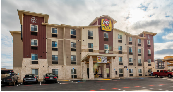
My Place Hotels has expanded throughout the U.S. in just six years.